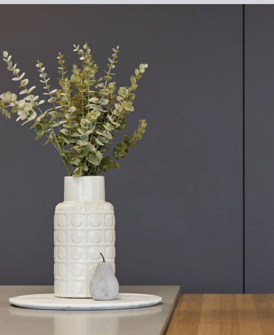
TidalDrift®Matte, Internal Insulated Panels, Pauanui

A refined choice which proves beauty is in the detail, when transforming the look of your home.