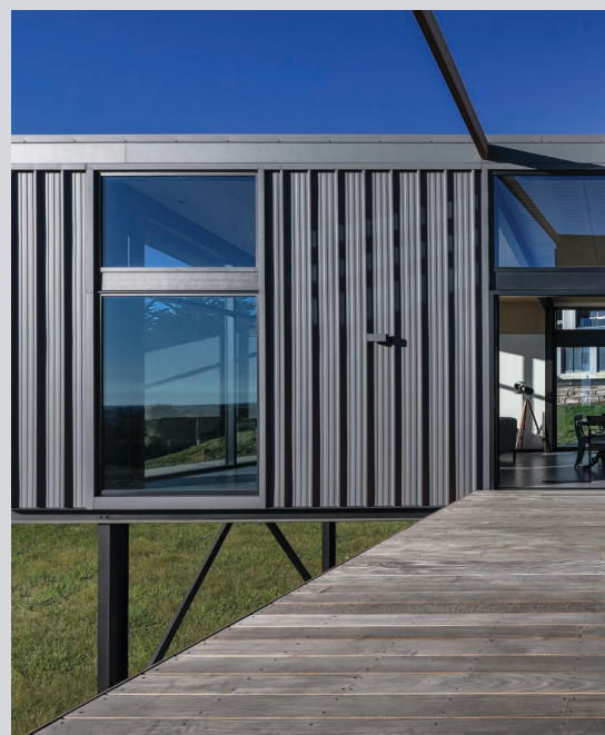
TidalDrift®Matte, Trapezoidal Profile, Christchurch