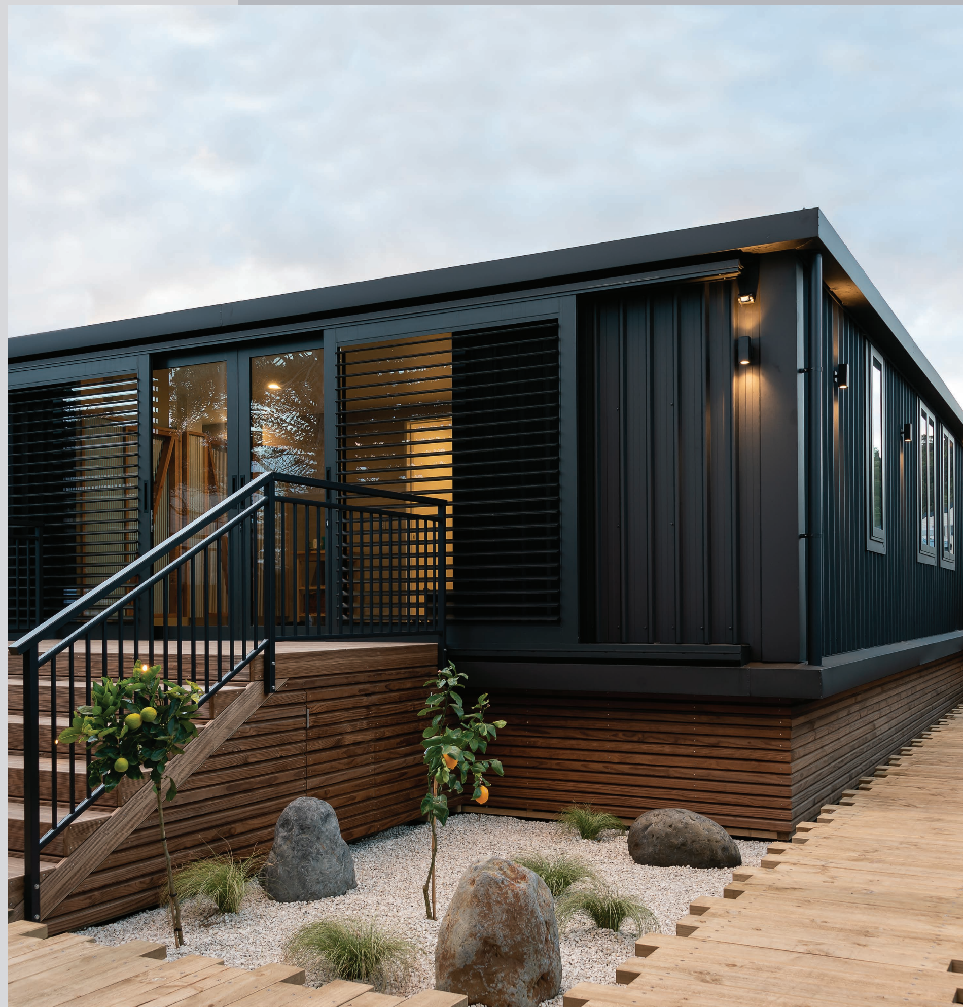
FlaxPod®Matte, Tray Profile, Waihi